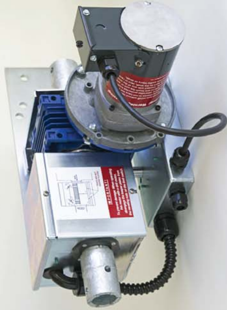
VC 100A Vent Drive

Take advantage of Wadsworth's 40 plus years of experience in automating vents. Our drive units set the standard for powerful performance, smooth operation and reliability.