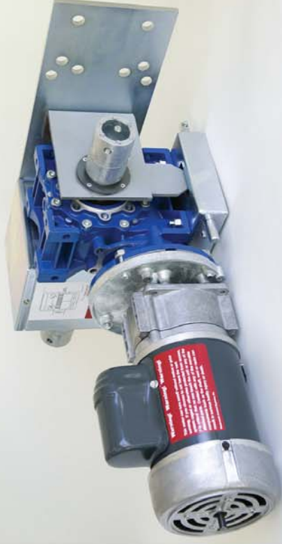
VC 2000 Vent Drive